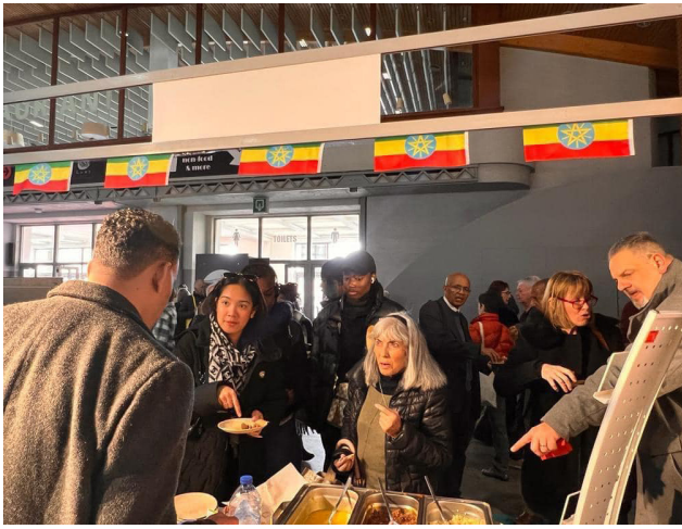
Ethiopian traditional cuisine and coffee ceremony at the Brussels Holiday Fair.