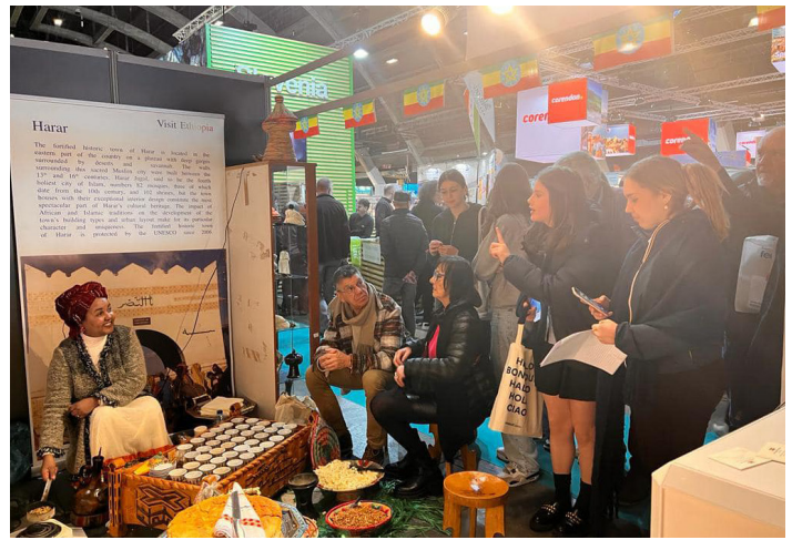
Ethiopian traditional cuisine and coffee ceremony at the Brussels Holiday Fair.